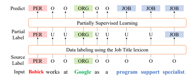
Figure 1: Applying of our method to an illustrative sentence for additionally introducing Job Title in the target task. Here, words in blue color constitute a job title. "Partial Label" corresponds to the automatically obtained partial labels using the job title lexicon, where "U" means the label of the word is unknown (can be "O" or "JOB"). "Predict" denotes the expected labels predicted by our model.

source task to the target task using only the labeled data of the source task and entity lexicons of the newly introduced entity types. Note that the collection of entity lexicons is often much easier than data annotation. For example, we can ask the language experts familiar with NER to provide some common mentions of the new entity types, or we can collect some confident mentions of the types from the internet to construct the lexicons. In some cases, we can even ask the clients of the target system to provide the lexicons, and usually, they are more willing to do so than annotate data.